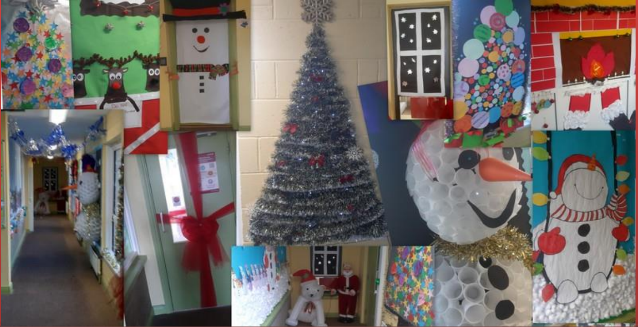
'Junior infants have been busy with their Christmas and winter art. Well done!'

Congratulations to our Cairde Team, for winning a prize in Navan Education Centre school competition for their Winter Wonderland Christmas Art Display! Your creativity and festive spirit truly shone through your beautiful artwork. It is a well-deserved victory that reflects the talent and effort each of you put into making the holiday season brighter for everyone. Bravo on a job well done!