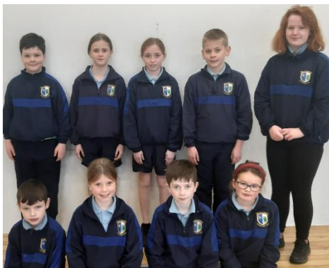
Credit Union Colouring Competition Winners